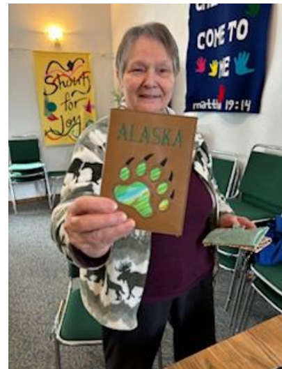
Geri's reverse applique design on a small notebook cover