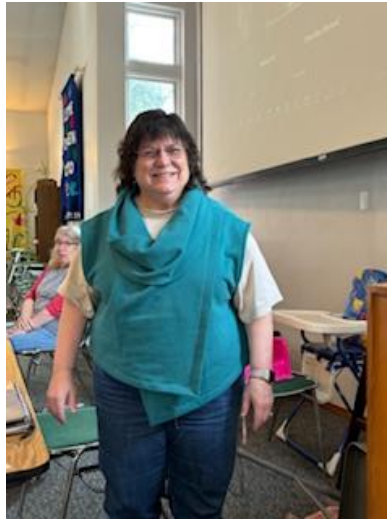
Dixie's new vest