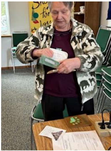
Geri shared her flat tray