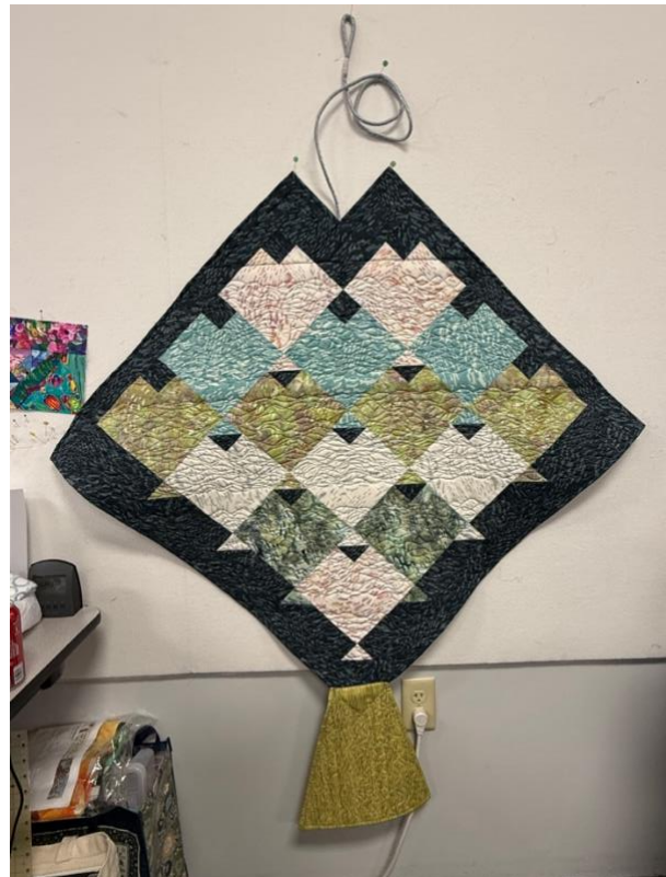
Dixie Alms shared her one block wonder (octagon) halibut and the back showing baby halibut.