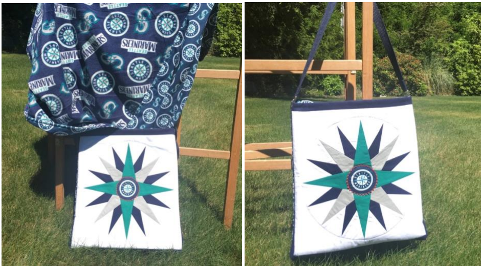
Baseball Quillow and Tote